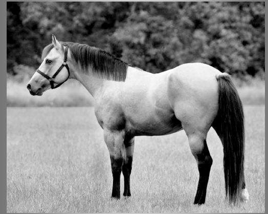
Jessie Jimmie Triple-bred 37.5% Jessie James Buckskin Service Sire of Lots #24 and #61.

Selling Own Grandsons of Poco Bueno!! Lots #33, #34 and #35